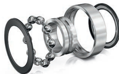
FAG's FD deep groove ball bearings with stainless steel components